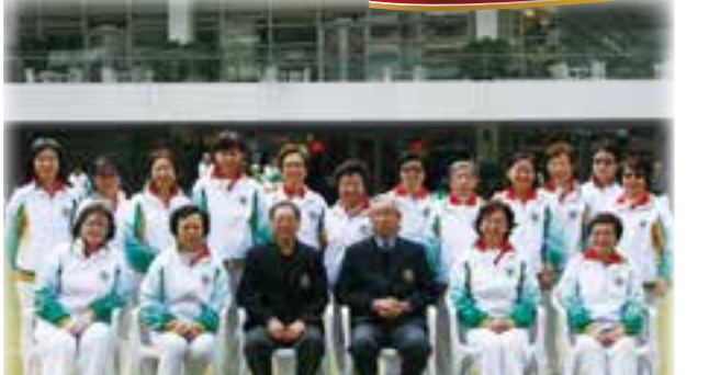
Division 3 - Champions - CCC-B