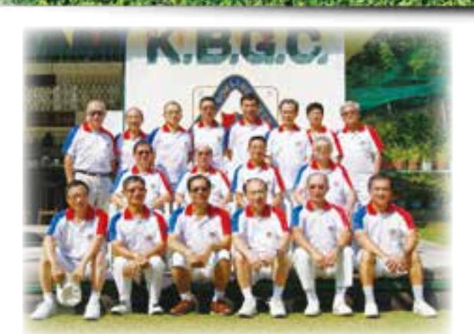
Men Division 6 – Champions – KBGC-D