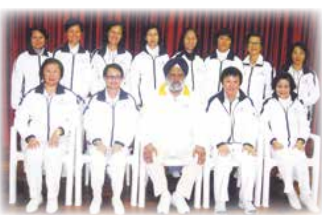
Division 2 - Champions - IRC-A