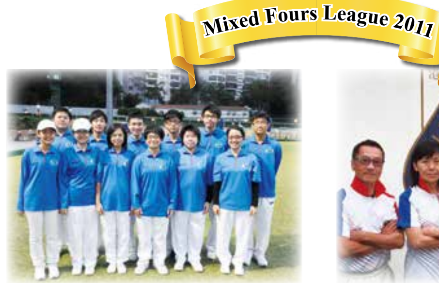
Division A - Champion - HKYDT-A