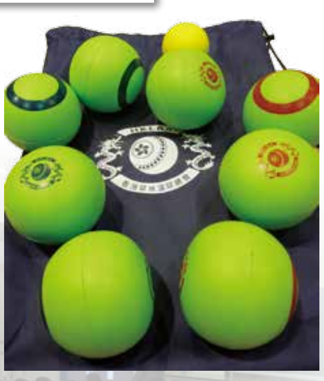
A set of Soft Bowls includes a yellow jack and eight green bowls (four with red marks and four with blue marks) in a handy carry bag.