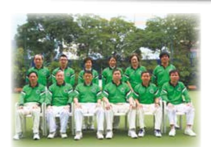
Division B - Champion - HKPBC-A