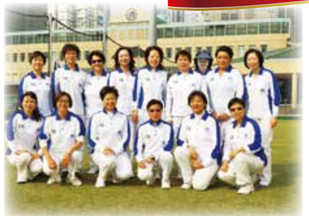
Division 1 - Champions - HKFC-A