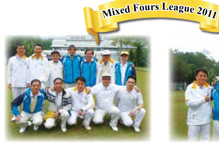
Division E – Champion – CLP-A